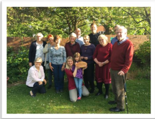
A very happy livesimply group.