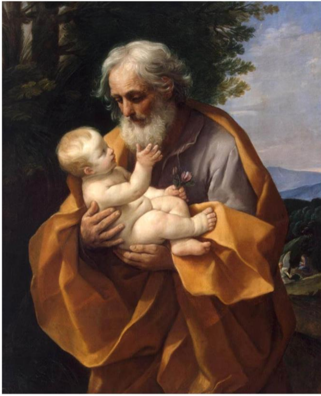
Guido Reni St Joseph with the infant Jesus 1620s